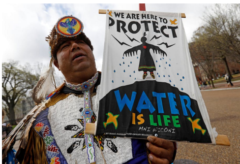
An activist at a protest rally at the White House against the Dakota Access and Keystone XL pipelines in Washington, D.C